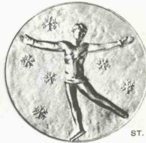
ST. MORITZ 1928