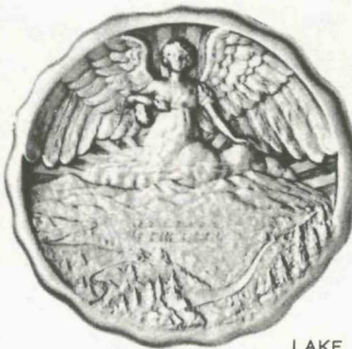
LAKE PLACID 1932