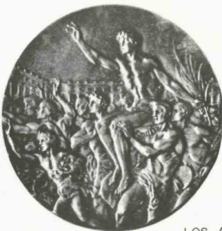
LOS ANGELES 1932