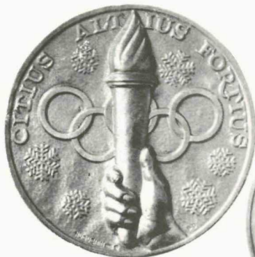
ST. MORITZ 1948